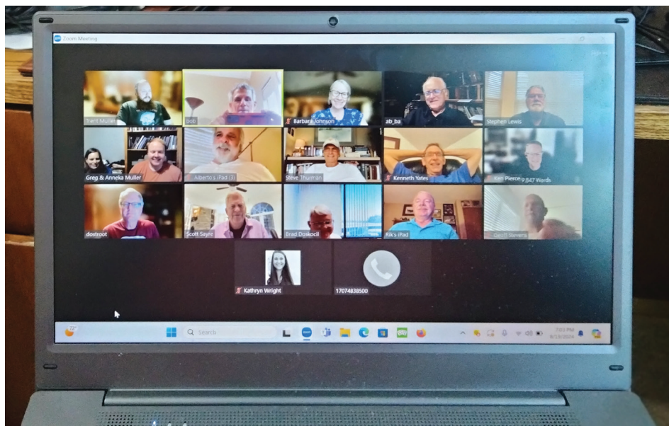
Old Testament Commentary Meeting August 19th