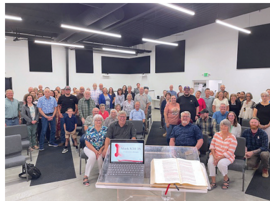
Truth Fellowship Live Sunday morning