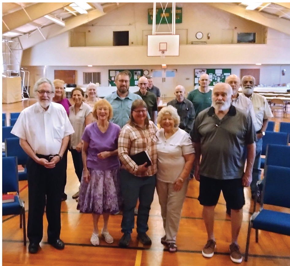
Berean Memorial Church, September 8