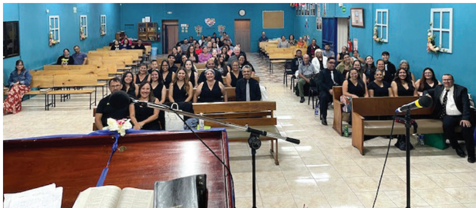
Sunday night at the Costa Rica Conference (Sept 22)