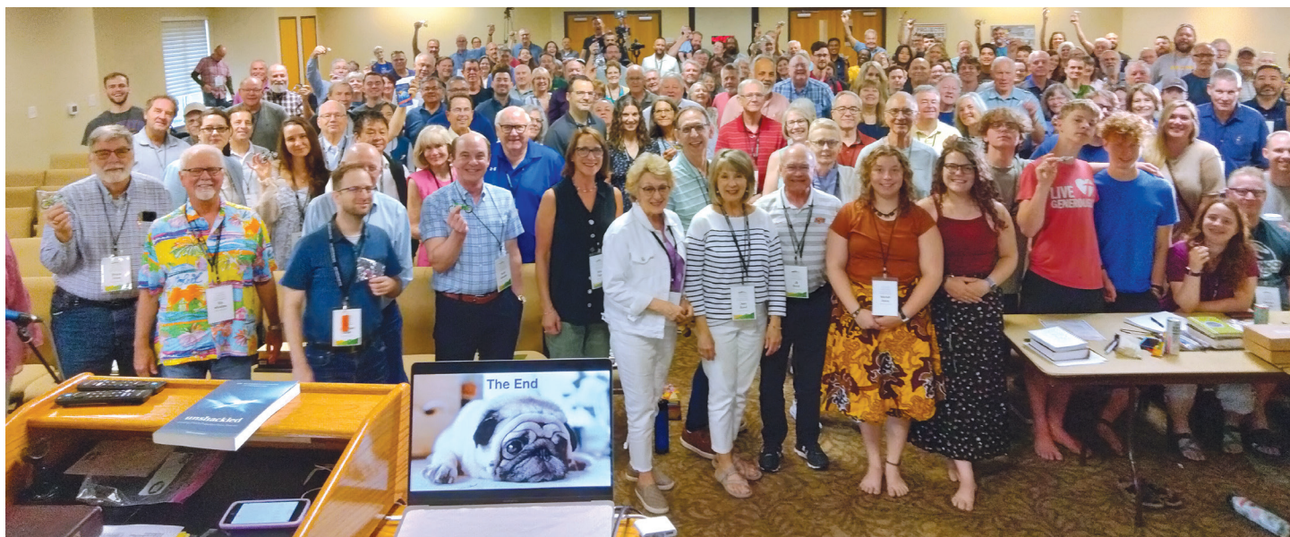
2024 GES National Conference Attendees