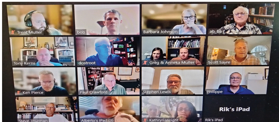
July 15 Meeting of Old Testament Commentary Authors and Editors