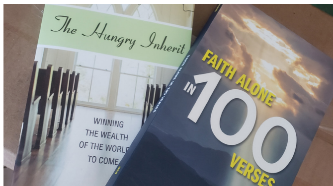
Top: Zoom class for Word of Life Bible Institute in South Korea; Bottom: Books we'll be handing out to Bible study groups in Nairobi.

We are still planning on a pastor's conference in Costa Rica the last week of October. I found out that I will also have the opportunity to teach a short course at a Bible college there.