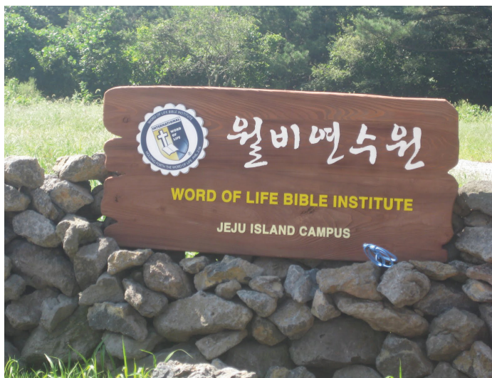
Pray for fruitful ministry here

students, grading, and taking care of the technology. I couldn't do it without her.