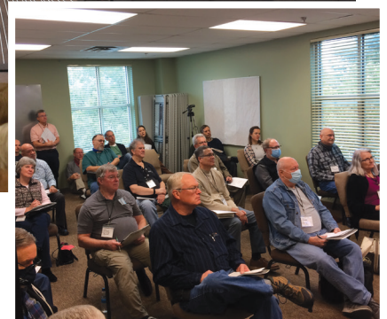
Distanced but full

Here are some of the comments: "Awesome! Great to be here!" "So encouraging." "The Conference exceeded my expectations, especially in light of Covid-19!" "Great experience!" "Excellent—so glad I attended." "Stimulating, stretching, encouraging, at times convicting." "Stimulating and provoking us to love and good deeds!" "Great!" "Mind-blowing. Pure Gold. Revolutionary."