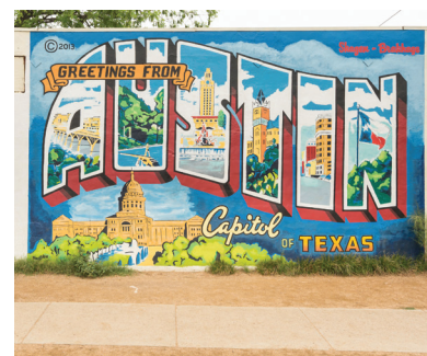
February Regional in Austin!

Be sure to keep up with GES speakers on our events page!