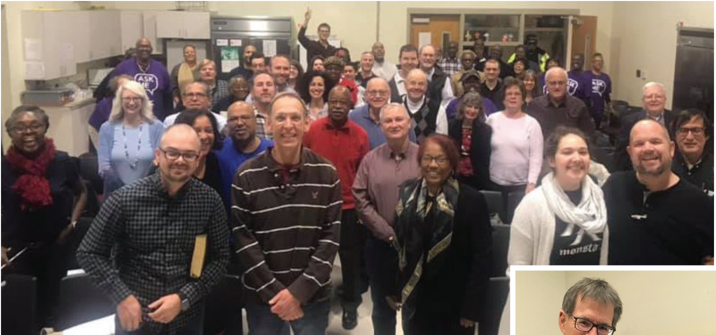
Friends—both new and old—in Camden, NJ!