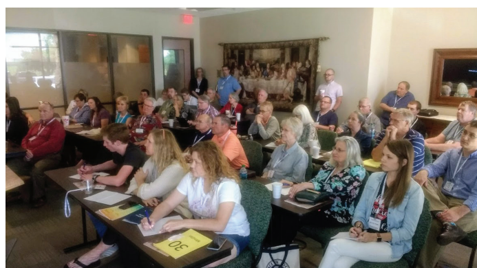
Standing room only.