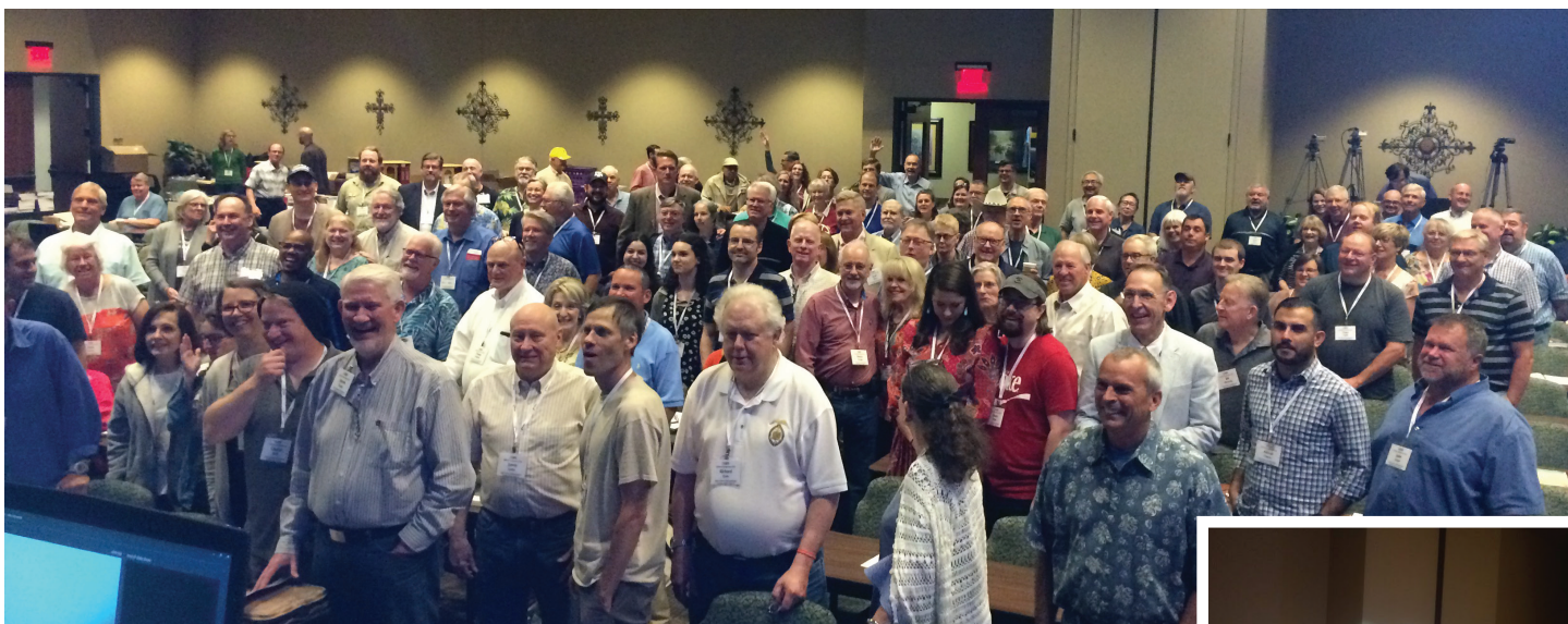
Best attended conference in five years. It keeps growing!