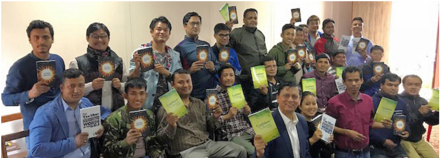
Grace literature for these Nepalese students