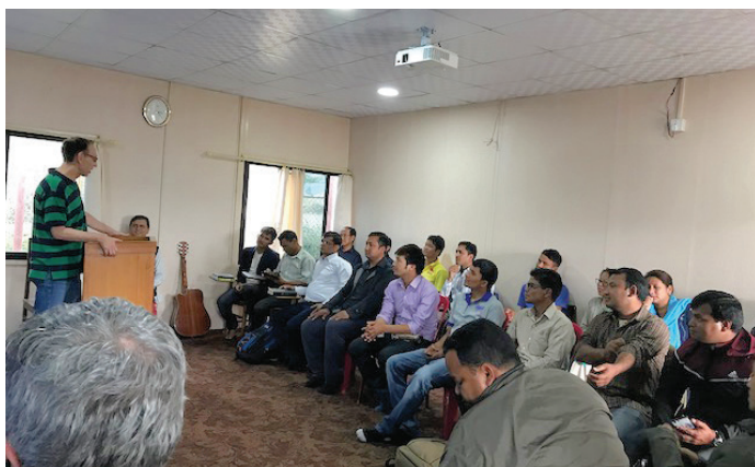
Teaching Free Grace in Kathmandu