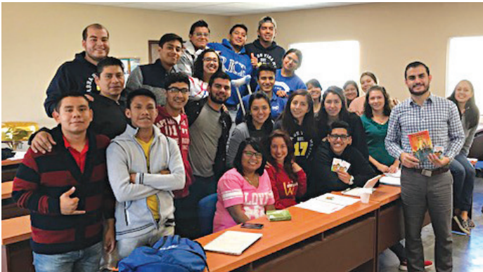
Students from Palabra de Vida