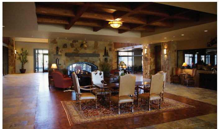
The Hope Center Lobby