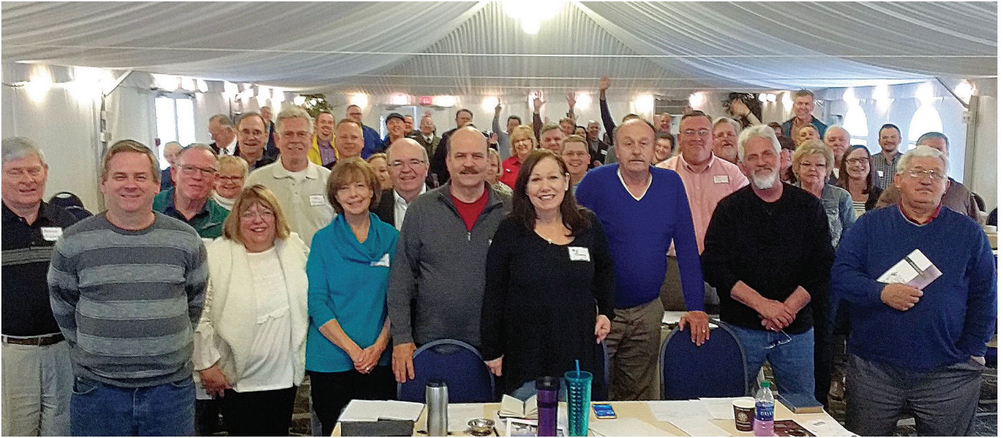
Good times and refreshing teaching in Atlanta.