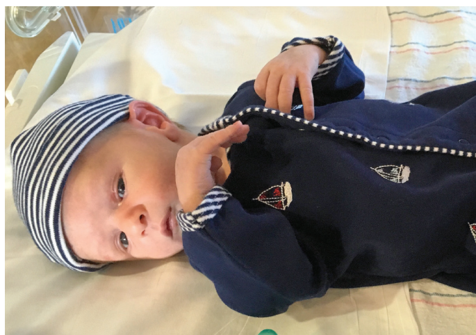
He might be cute, but can he proofread?