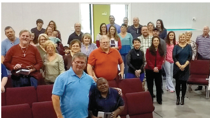
The believers at Grace Community Church

once. I kept thinking, Just one step at a time. Keep going. I finished in 6 hours 31 minutes, for my slowest marathon ever. But I finished! And it appears I don't have any injuries. PTL. I met a lot of interesting people during the race.