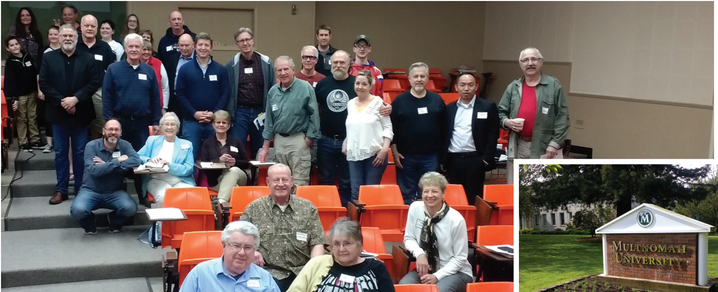
Free Gracers in the Pacific Northwest!