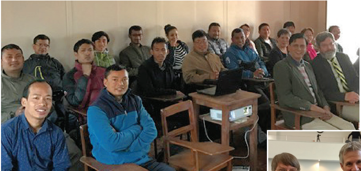
Preaching eternal life in Nepal