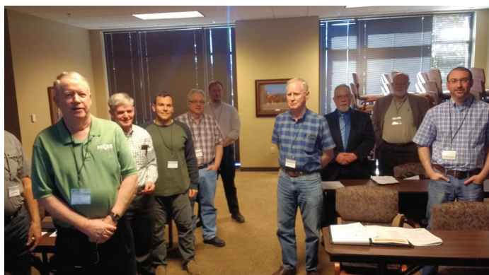
ISCA breakout session.