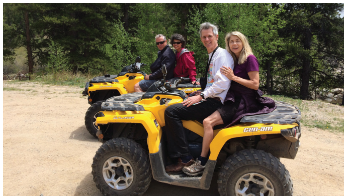
They got a need for speed