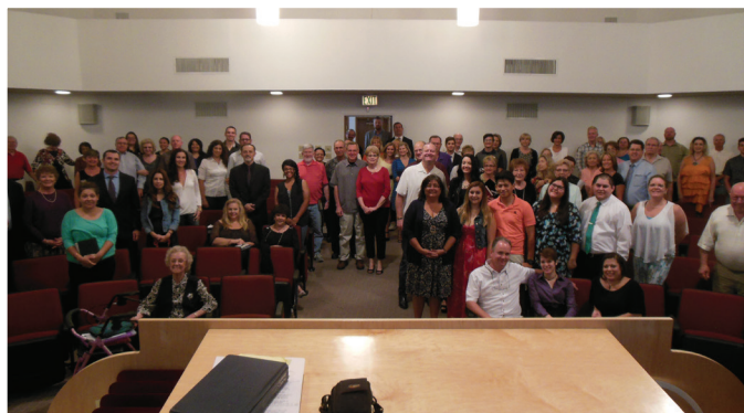
Don't gamble with your soul! Go to Upland Bible