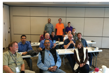
Chaplains turning lives around

After resting up and doing writing projects on Monday, I spoke to about a dozen chaplains at Denver