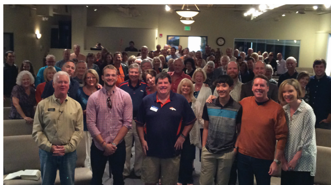
Getting high on grace in Denver