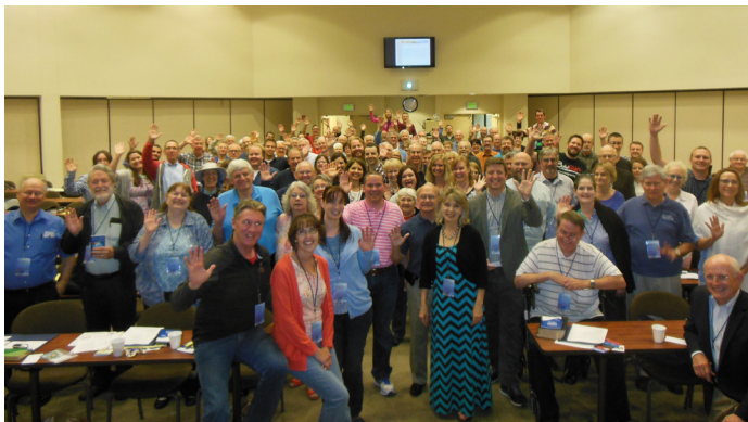
Can't wait to see these fine people again