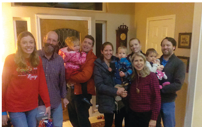
Staff Christmas Party!