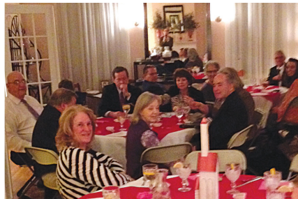
People who love giving out the Word