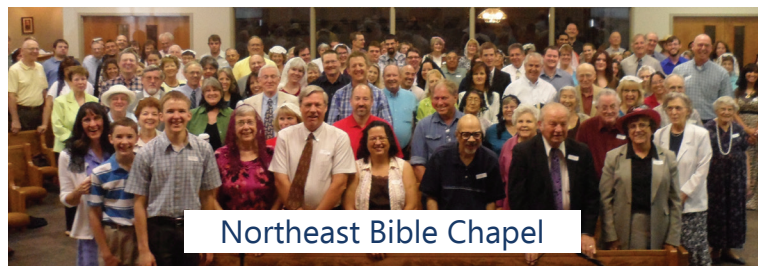
Northeast Bible Chapel