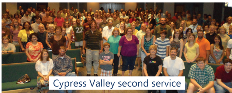
Cypress Valley second service

In the two services I spoke on Faith: One of the Most Misunderstood Words in the Bible. It was a condensed form of the first chapter of my new book. I was encouraged in that it was well received.