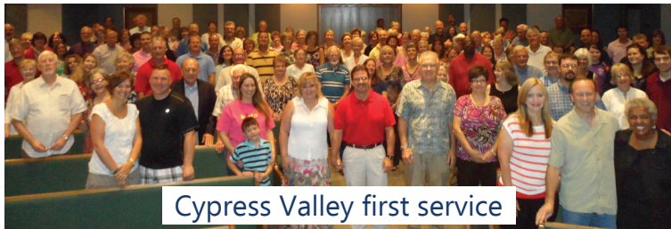
Cypress Valley first service