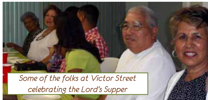
Some of the folks at Victor Street celebrating the Lord's Supper

Once again we will be meeting at the excellent conference facilities of Southwestern Baptist Theological Seminary in Fort Worth. There are 55 excellent hotel rooms in the conference center and six inexpensive dorm rooms in a dorm that is just 400 yards away. It would be a good idea to reserve your room now since they fill up fast.