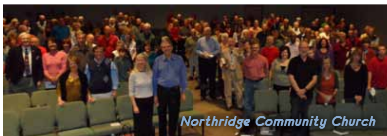
Northridge Community Church

In both services I spoke on the parable of the four soils in Luke 8:1-18. My title was "Take Heed How You Hear." Several GES partners were present in the audience and we were able to visit before and after the services.