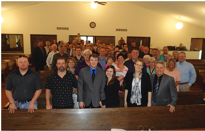
The congregation at Jansen Bible Church.

It is good to know I can still finish a half. This November I hope to do a marathon again. But if so, I think this will be my first one over 6 hours since it is a difficult course (8 and a half laps of a lake on a jogging trail). I think I'll shoot for under 7 hours.