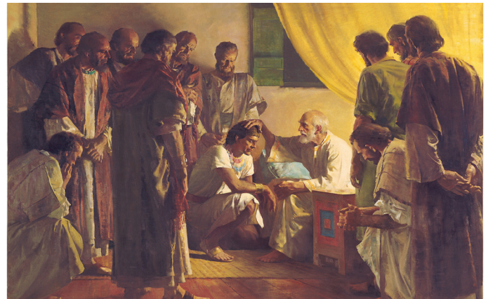
Jacob blesses his twelve sons

In the Lord's Supper meetings I covered Revelation 2 on November 10th and Revelation 3 on November 24th, giving overviews of each chapter.