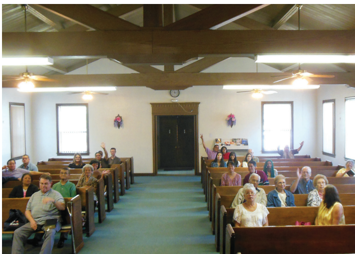
Doing the Wave at Victor Street