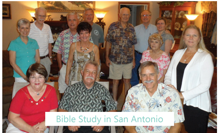
Bible Study in San Antonio