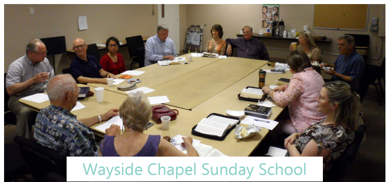
Wayside Chapel Sunday School