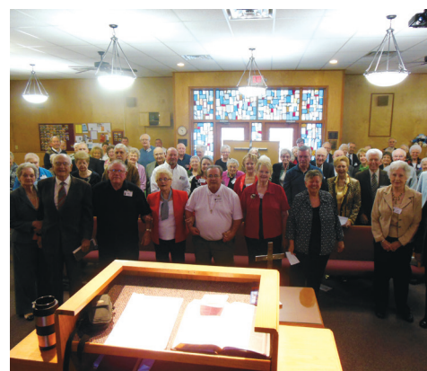
Protestant Fellowship Church

The group was appreciative of what I had to say. It was good to be a young person on Sunday. I'll be 63 in May. They told me I didn't look a day over 61. At 63, I was barely old enough to live there as the minimum age is 62.