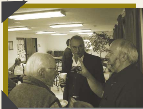
fellowship at spokane conference