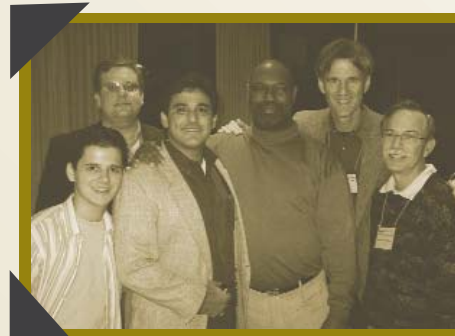
bob with several ges members at ets

Several of the messages which I heard were helpful and some of them might be ones that will appear in our journal in the future. PG