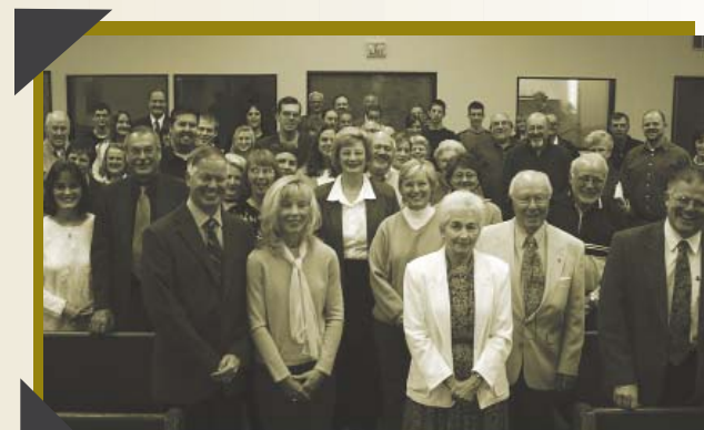
spokane bible church