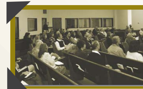
audience at the spokane regional conference

The fellowship meal is once again on Tuesday night. The cost is $25 per person for a wonderful time of sharing and interaction. That is the actual price the hotel charges us, and it includes taxes and gratuity. If you sign up for the banquet by December 31 st , GES will pick up part of the cost of your meal. The early bird price is just $20 per person.