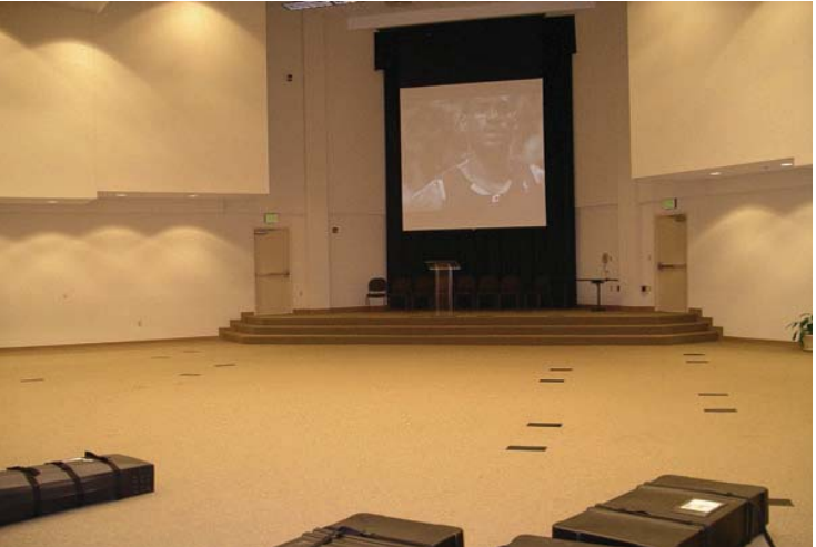
The main meeting room at SWBTS should allow all conference attendees to sit at tables

rooms in a dorm (Barnard Hall) across the street. Breakfast, a newspaper, and complimentary gourmet coffee is available to all staying in the 55 conference center rooms. If you wish to reserve a hotel room on site now, you can call the conference center guest housing at 1.817.921.8800. Or you can email them at guests@swbts.edu . Please indicate you are with the GES conference. To reserve your room all you need do is