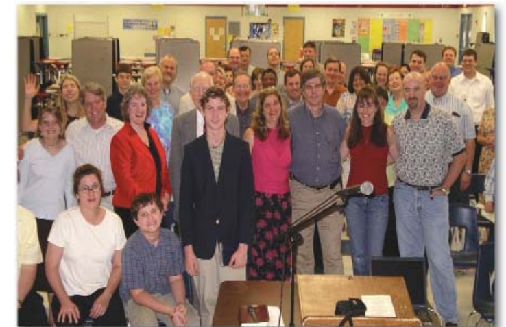
Bastrop Bible Church on May 7

Bastrop is about 90 miles from Austin. PG