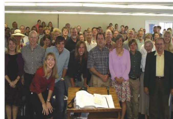
Brenham Bible Church on May 21