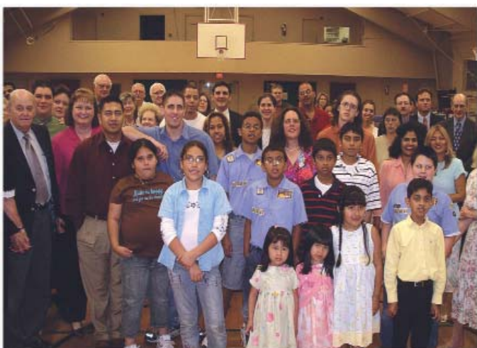
Berean Memorial Church celebrated their 55th annual Spring banquet