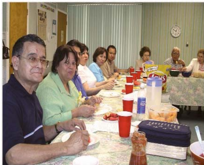
The Lord's Supper at Victor Street Bible Chapel