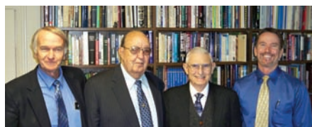
Deacons of ECSBC

The people were very positive in their comments after the service.