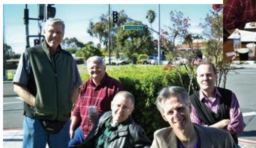
The Board (right) & at lunch in San Clemente, CA (below)