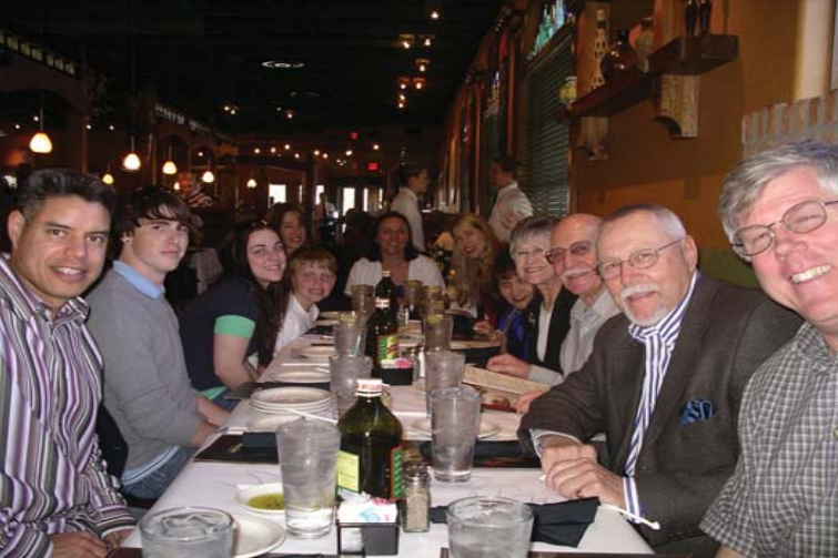
The Lunch Gang from Grace Chapel