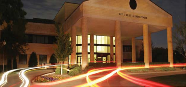
Entrance to conference center

the cost of food at the conference center are much less expensive this year, even with the cost of the shuttle this year's conference will be much less expensive than our previous conferences have been.