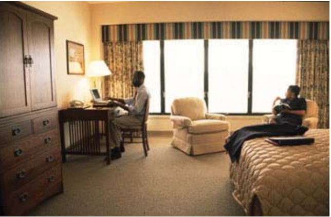
Queen room at conference center

You may get more information and register online at www.faithalone.org . Or you can register by phone calling us at 972.257.1160. The registration fee is $75 (or $30 for students). We hope to see many of you there. We'd appreciate your prayers that we have a good attendance, that the speakers remain healthy, and that the messages are outstanding.