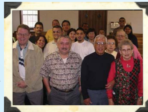
Victor Street Bible Church before Bob Spoke

I've begun a new series at Victor Street Bible Church on the Book of Acts. I covered one of the most important chapters in Acts in a sermon entitled, "The Church Is Born" from Acts 2:1-47. It gave me a chance to cover a