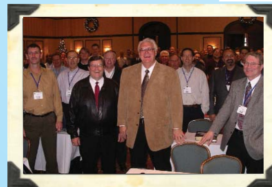
The Pre-Trib Study Group before Bob Spoke

Pre-Trib Study Group continued on page 2